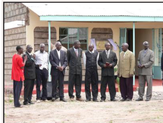
The Ilchamus project advisory committee in front of the new office