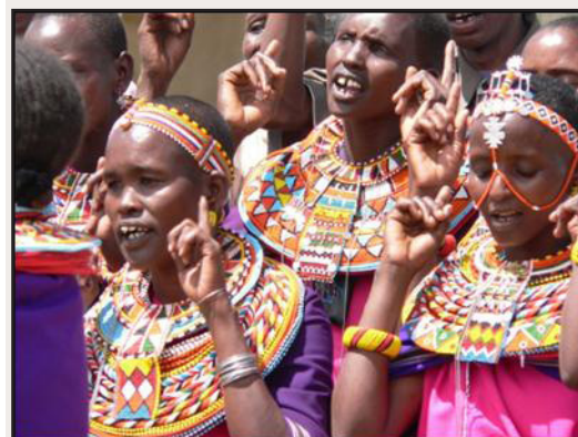
Samburu choir praising God