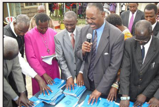
Dedicating the Samburu Gospel of Luke