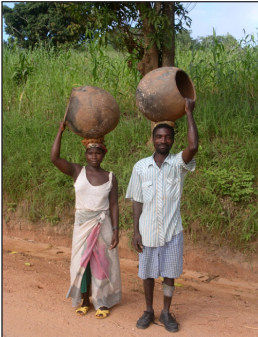
Meetto people starving for God's Word need the Bread of Life and Living Water