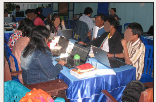
Consultant checking Psalms 51–75