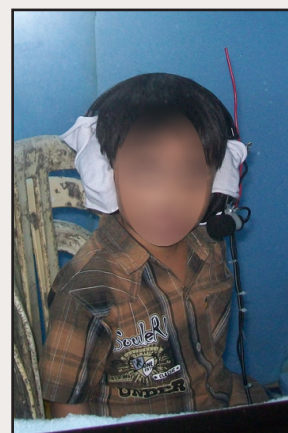
The little boy recording the voice of Jesus