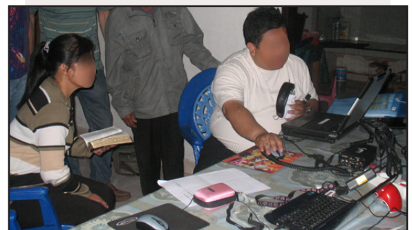
Recording the Hua New Testament