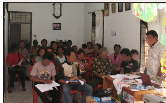
Ethnomusicology session at the workshop