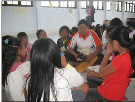
Hua children learn God's Word

Two local women came to the largest Hua village to introduce a new creative method of teaching Sunday school to elementary-age children. This activity had the blessing of the main Hua church leader. After five days, the teachers were very thankful to learn a special way of teaching Bible stories in the local language. The children also did Bible-verse memorization and sang songs in the local language. Now the teachers know how to teach the children Bible stories as well as pray in the mother tongue.