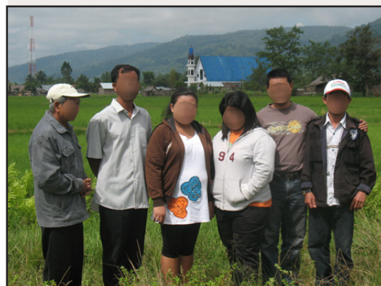
Hua translation team