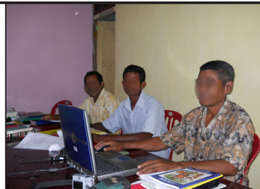
Scripture-use workshop participants

The four Enula-speaking participants at a recent Scripture-use workshop exhibited great enthusiasm for discovering ways to make the Enula New Testament relevant in their churches and everyday lives. Learning to pray in their own language and sing worship songs in Enula were high points. The participants also listened to Bible stories and learned how to internalize and retell them. Then they were taught how to formulate short devotional messages based on the main points of the stories.