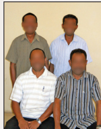
The Enula translators

All 27 New Testament books are "God-breathed" (2 Timothy 3:16), which means soon people will be reading the very words of God. They'll discover for themselves that "the Word became flesh and dwelled among us" (John 1:14) and that "there is no other name given under heaven by which we must be saved" (Acts 4:12). Children will be able to memorize verses such as John 3:16—"God so loved the world that he gave His one and only Son, that whoever believes in Him shall not perish but have eternal life."