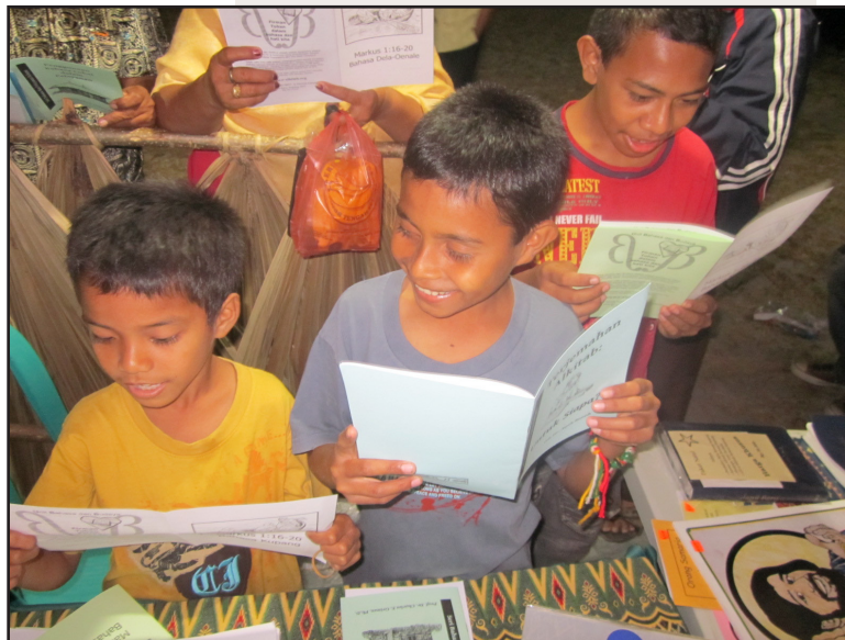
Dela boys are excited to read books in their language at the translation booth