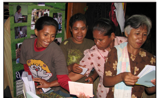
Amarasi women excitedly buy books in their language