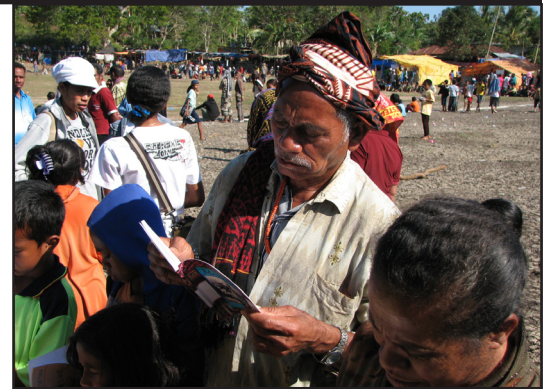
On Indonesian Independence Day, an Amarasi man reads Mark with full concentration